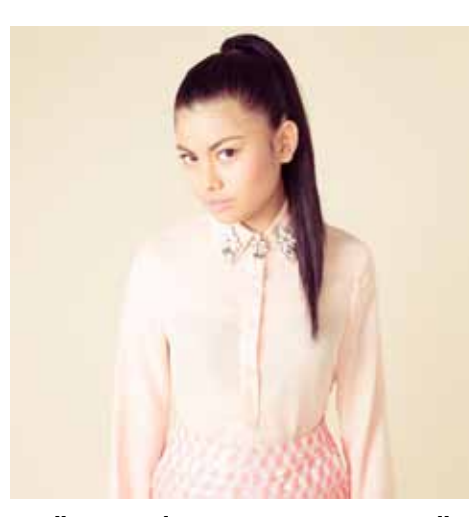
Marlisa Punzalan, 2004 X Factor Australia winner.