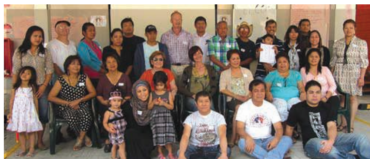
KCL tenant-members after one of their bi-monthly general meeting.